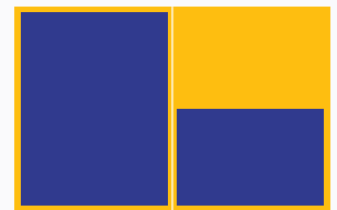
Full Page 7.5" x 10"