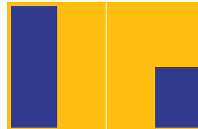
1/2 Page Vertical 3.625" x 10"